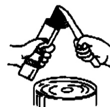
Fig. 3: Loading with Bulk Filling