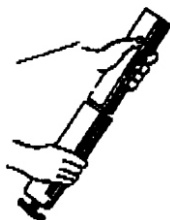
Fig. 1: Cartridge LoadingSuction

Do not use MULTI-LOADING alternately, please decide to use a long-period and proper loading way initially (depends on the variety of grease that your local supplier applied) and use it incessantly without change.